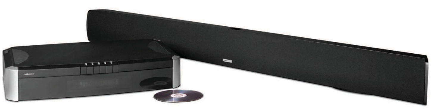
SURROUNDBAR360° DVD THEATER